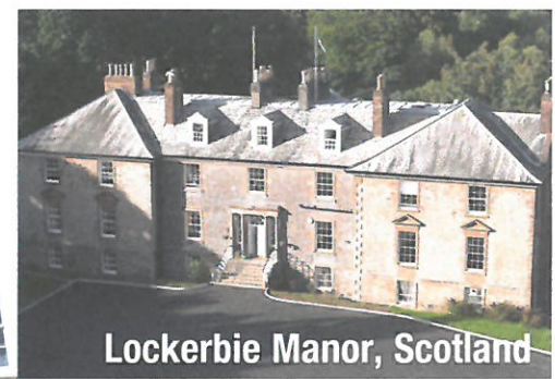
Lockerbie Manor, Scotland