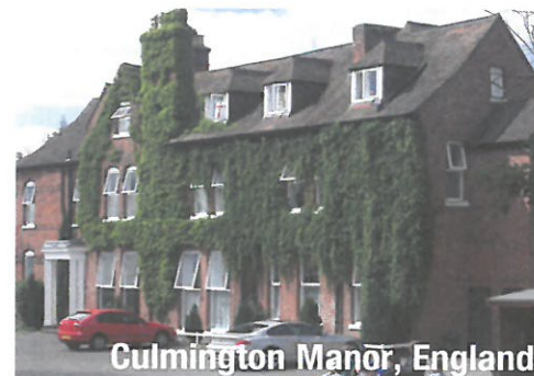
Culmington Manor, England