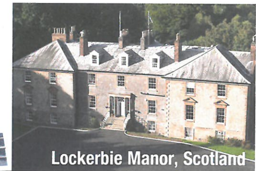
Lockerbie Manor, Scotland

Your views are very important to us. We would greatly appreciate five minutes of your time to complete and return this form to reception prior to your departure