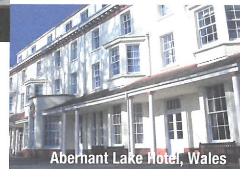
Abernant Lake Hotel, Wales