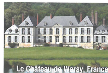
Le Château de Warsy, France

We hope you have enjoyed your visit with us