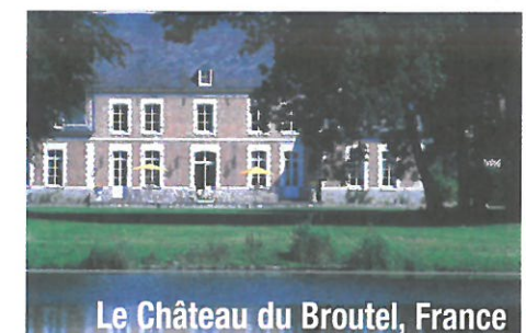
Le Château du Broutel, France

Le Château de Warsy & Le Château du Broutel