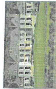
Le Château de Warsv