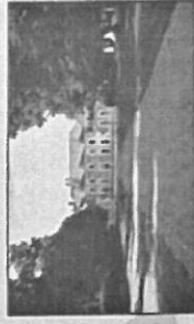
Le Château du Brouet