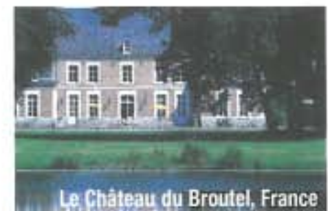
Le Château du Broutel, France

Le Château de Warsy & Le Château du Broutel