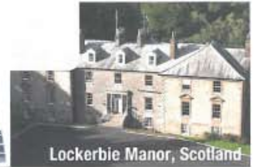
Lockerbie Manor, Scotland

Your views are very important to us. We would greatly appreciate five minutes of your time to complete and return this form to reception prior to your departure